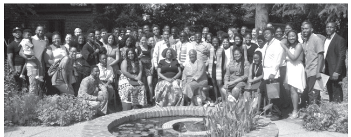
Armstrong Leadership Program Closing Awards Ceremony, June 4, 2017

Learn more about Armstrong Leadership Program through Yvette Rajput at 804-783-7903, ext. 13, or, alp@richmondhillva.org