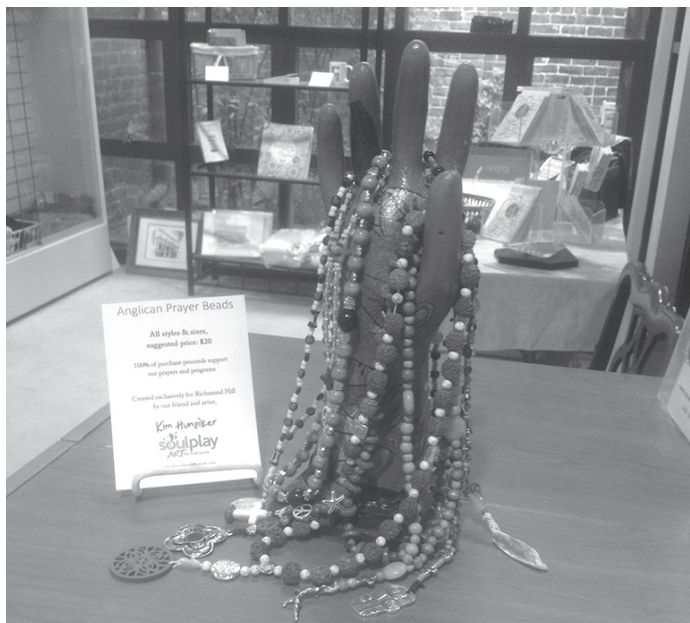
Prayer Books, Beads, and Blessing Bands make wonderful Christmas Gifts... Now on sale in the Richmond Hill Bookstore

December 31, 2017. We pray for the families of Metropolitan Richmond: For peace, reconciliation, forgiveness and accord among family members, whatever the distance, and however old the hurt or grievance.