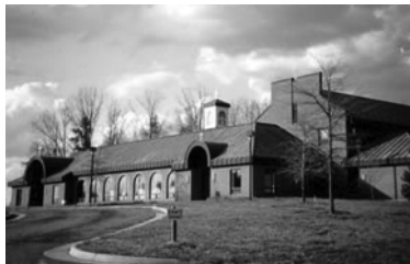
Monte Maria, the Monastery of the Visitation of Holy Mary, relocated to Rockville, Virginia, in 1987

Through their contemplative life, lived in a community of charity, the Sisters continue their "watching and waiting for the Lord." Their silent testimony is a beautiful, specific way of extending the Kingdom of God, and of sharing in the evangelization of the world.