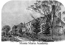
Monte Maria Academy