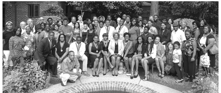
Shown above: Students, staff and mentors, Armstrong Leadership Program. Seen below: Graduating Seniors, ALP 2016